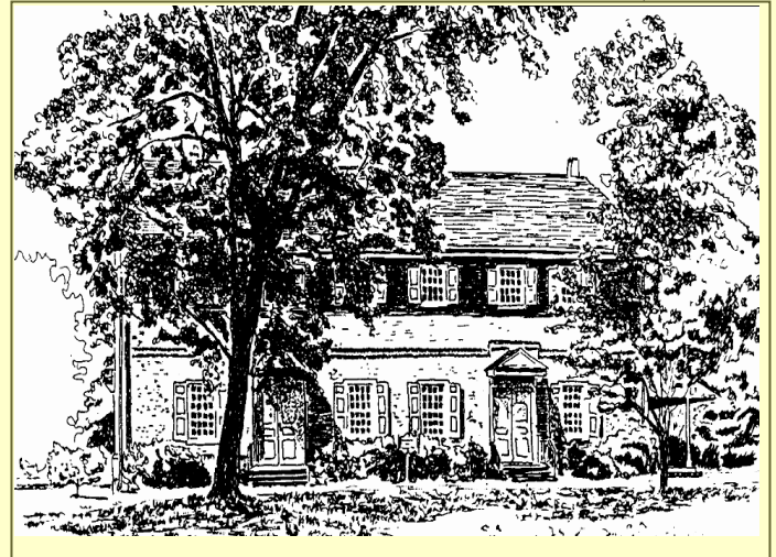
Crosswicks Meeting House 1773