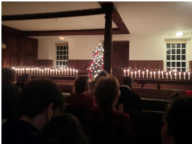
The candles are all lighted, with the Christmas tree, following the Candlelight Service in the Meeting House