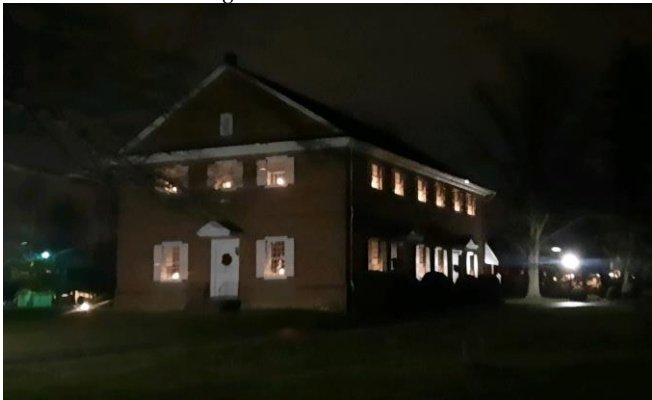
The Meeting House lighted and decorated for the Candlelight Service on December 18